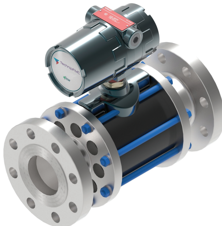
➤ Sure-Cut® Low Water Cut Analyzer

*Uncertainty quoted is 2 x SD to 95% confidence for a 1" analyzer versus Karl Fischer analysis of API 8.2 compliant auto samples. Quoted numbers overstate analyzer uncertainty as they include the uncertainty of sampling and lab analysis.