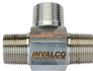
INVALCO Turbine Meters

Coriolis meters have a very wide turndown flow range and unlike volume, fluid mass is not influenced by changing process conditions such as temperature, pressure and viscosity. Besides offering high accuracy and bidirectional flow, Coriolis meters have the ability to measure several process variables at the same time. Mass flow, density and temperature are the primary variables that can be used to derive other values such as volume flow, solids content, concentrations and complex density functions.