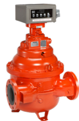
Smith Meter® F4 PD Meter

Multiphase meters (MPM) works over the full GVF range. The MPM meter combines the input from a gamma detector, dP, pressure and temperature transmitters and radio frequency dielectric measurements to form a multi modal tomographic system. Along with measuring multiple fluid phases, the MPM offers remote access and operation, diagnostic features, and self configuration.