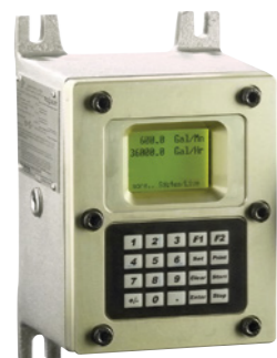
Smith Meter® microFlow.net™

Turbine meters are offered in several styles that provide rugged construction for long service life, high accuracy in the lower and medium viscosity range, high resolution pulse output and low maintenance in clean service applications for maximum cost-effectiveness.