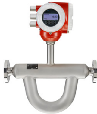
Proline® Promass Coriolis Meters

Coriolis meters have a very wide turndown flow range and unlike volume, fluid mass is not influenced by changing process conditions such as temperature, pressure and viscosity. Besides offering high accuracy and bidirectional flow, Coriolis meters have the ability to measure several process variables at the same time. Mass flow, density and temperature are the primary variables that can be used to derive other values such as volume flow, solids content, concentrations and complex density functions.