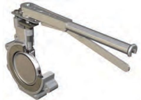
WKM high-performance butterfly valves provide low cost and lightweight solutions to demanding fuel loading and unloading applications.

Our WKM high-performance butterfly valves are engineered for reliable, repeatable sealing in fuel handling systems. The heavy-duty disc design is ideally suited to withstand the pressures associated with fuel loading/unloading and the wide disc edge provides a greater sealing area than traditional butterfly valves. A corrosion-resistant, single-component thrust bearing/disc spacer reduces body wear and helps ensure positive centering of disc in the valve bore, reducing the maintenance requirements of this valve.