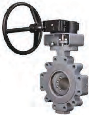
The WKM triple offset valve is a smaller, lighter valve that is easily installed next to a tank.

In addition to our valve solutions for tank storage isolation, our portfolio of power actuation technologies includes the LEDEEN* pneumatic and electric actuators. The consistent engineering design and efficient modular assembly allows increased operational flexibility to be achieved.