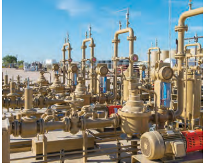
Cameron valves can also be used on CAM-LACT* units, which are in stock and ready to ship when dependable lease automatic custody transfer (LACT) equipment is required.

We also offer a complete line of cast, forged, and stainless steel gate, globe, and check valves in a full range of sizes and classes. All are inspected and tested in accordance with the most rigid quality standards and include ready-to-ship inventories and competitive lead times, which together allow your storage facility to come on line faster and operate safer.