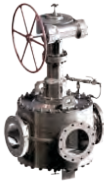
The seating segments can be removed from the top or the bottom and examined without having to take the valve from the line or disturbing the actuator.