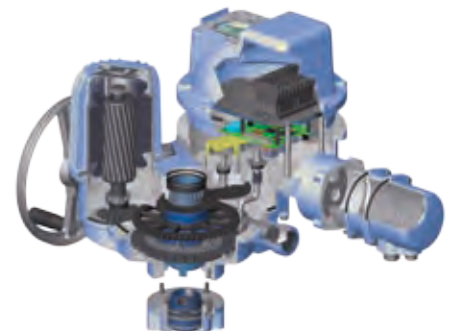
LEDEEN electric actuators