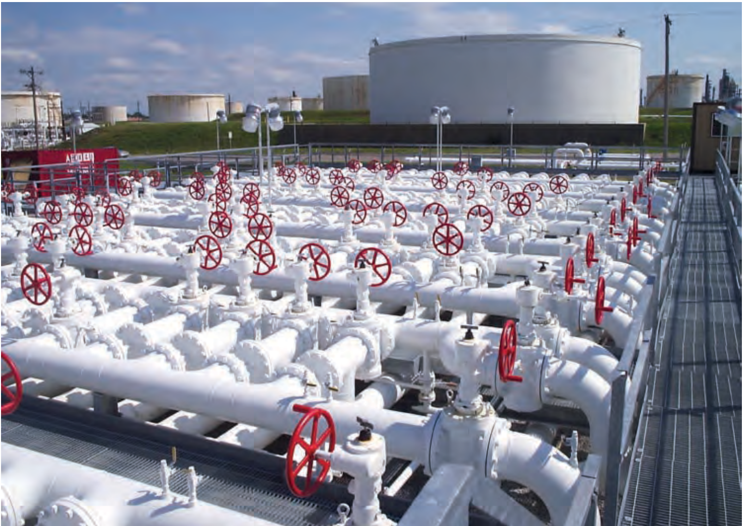
Busy multi-product manifolds require valves that can withstand the high-cycle environment with zero-leakage capabilities.