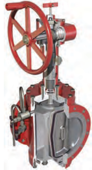
The mechanical wedge-action of the plug of the GENERAL VALVE Twin Seal valve compresses both the upstream and the downstream seals firmly against the valve body, needing no help from the line pressure.