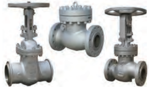
Our quick-turn, stocked NEWCO* gate, globe, and check valves are regularly utilized on LACT units and metering skids around the world.